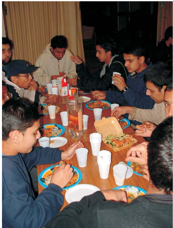
Students from KD Muslim Grammar School enjoy a well earned meal after a days work on the Faith in Community Allotment.

This will be an opportunity for people of faith