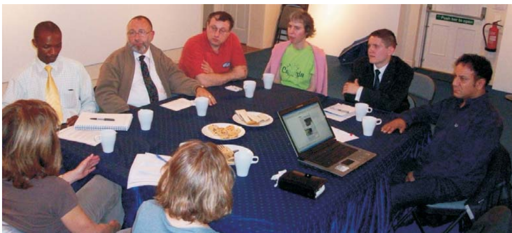
Participants at the first monthly interfaith dialogue event - a joint initiative of FN4M and the Muslim Jewish Forum funded by the CLG's Faiths in Action

We're 'growing up' and plans for the future will lead us towards playing a fuller role and offering expertise and resources across the voluntary and statutory sector. The core steering group is small but everyone is committed to working for FN4M to fulfil its potential. I feel privileged to be part of such a dedicated, faithful and friendly team.